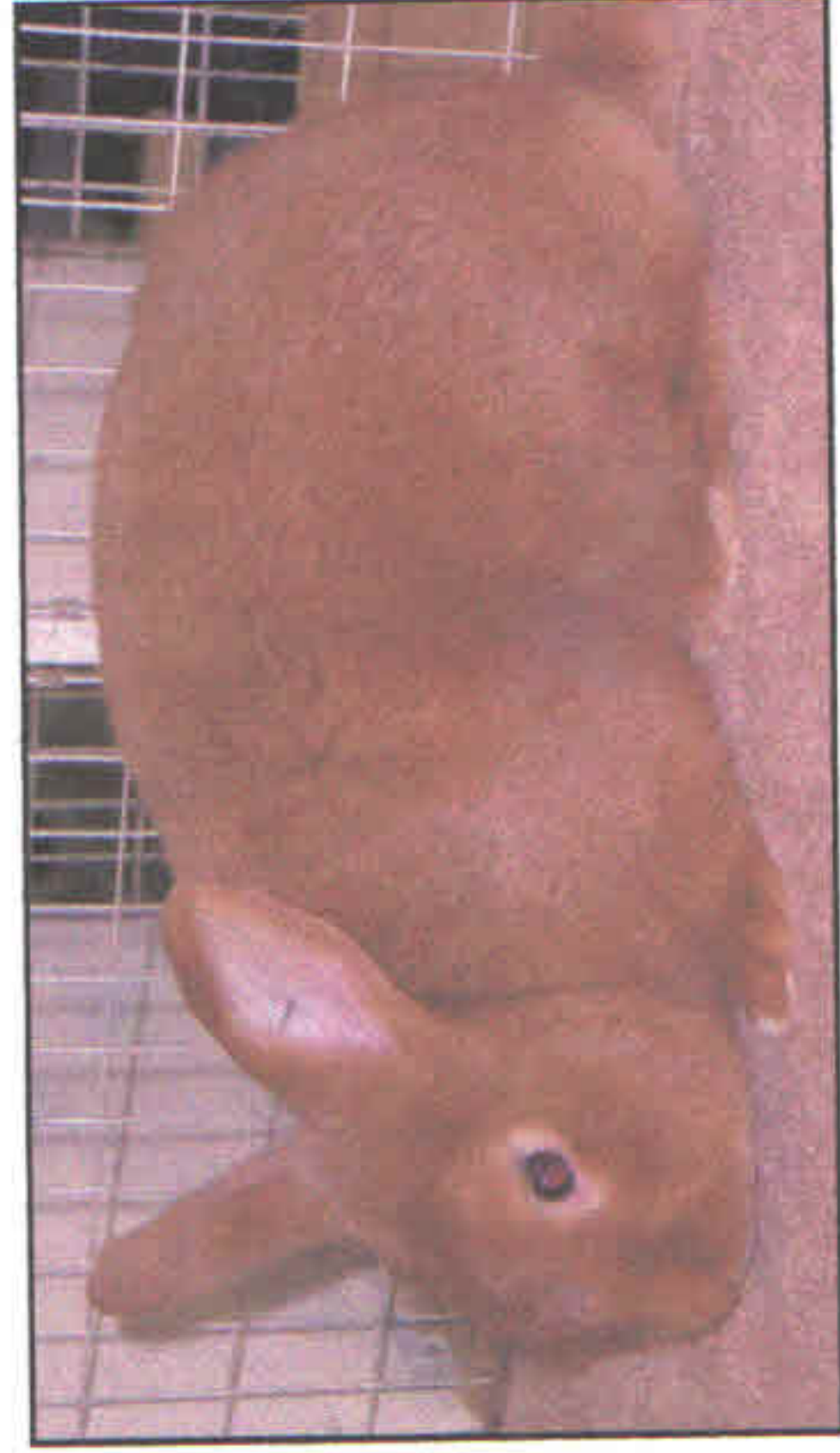
CJ, owned by Carrol Hooks