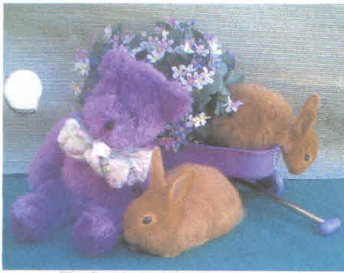
Ember and Tobasco