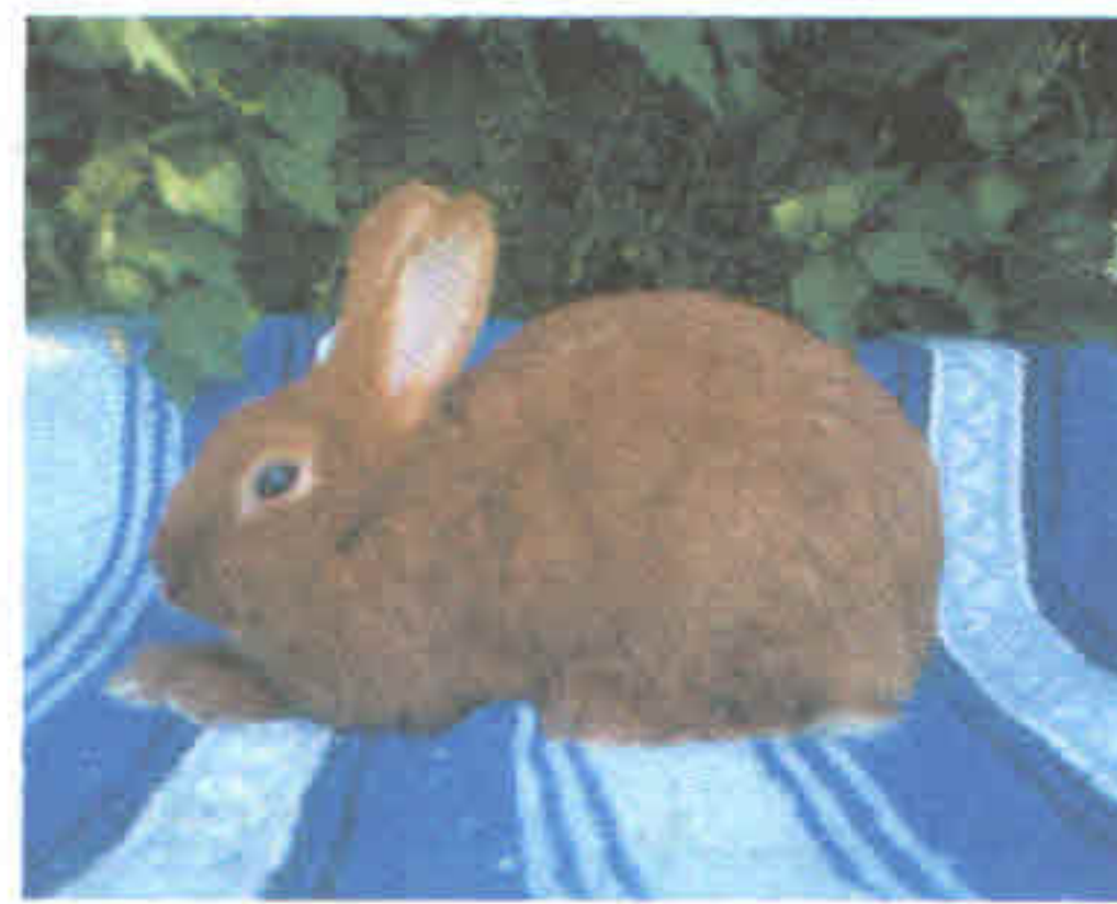
Carr's Tater