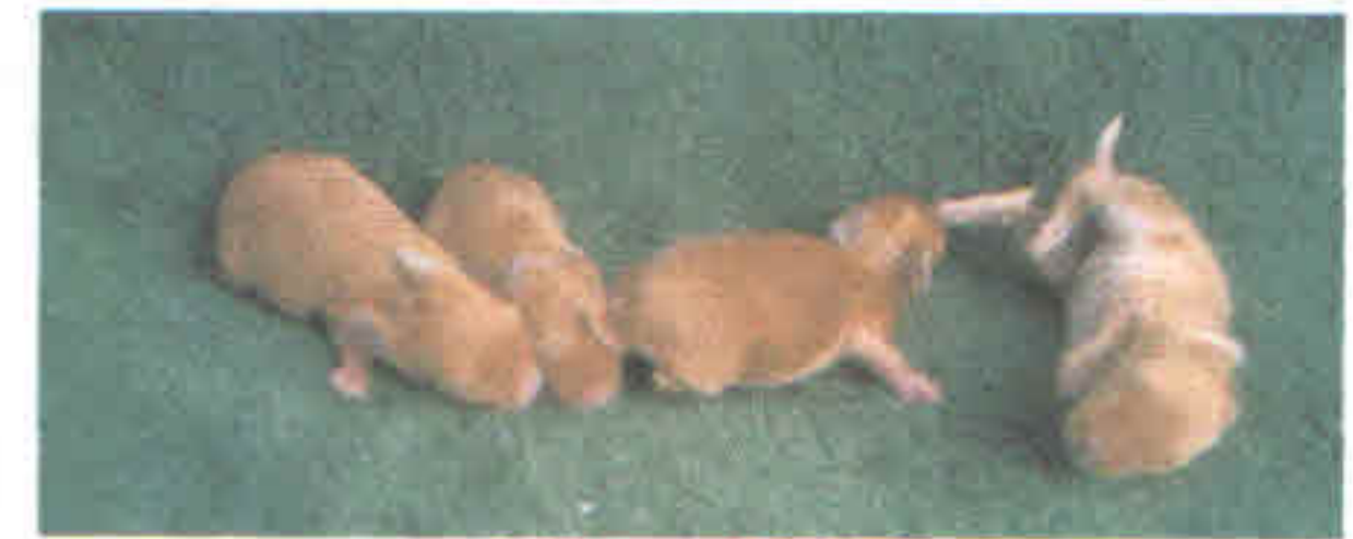
3 Day Olds!