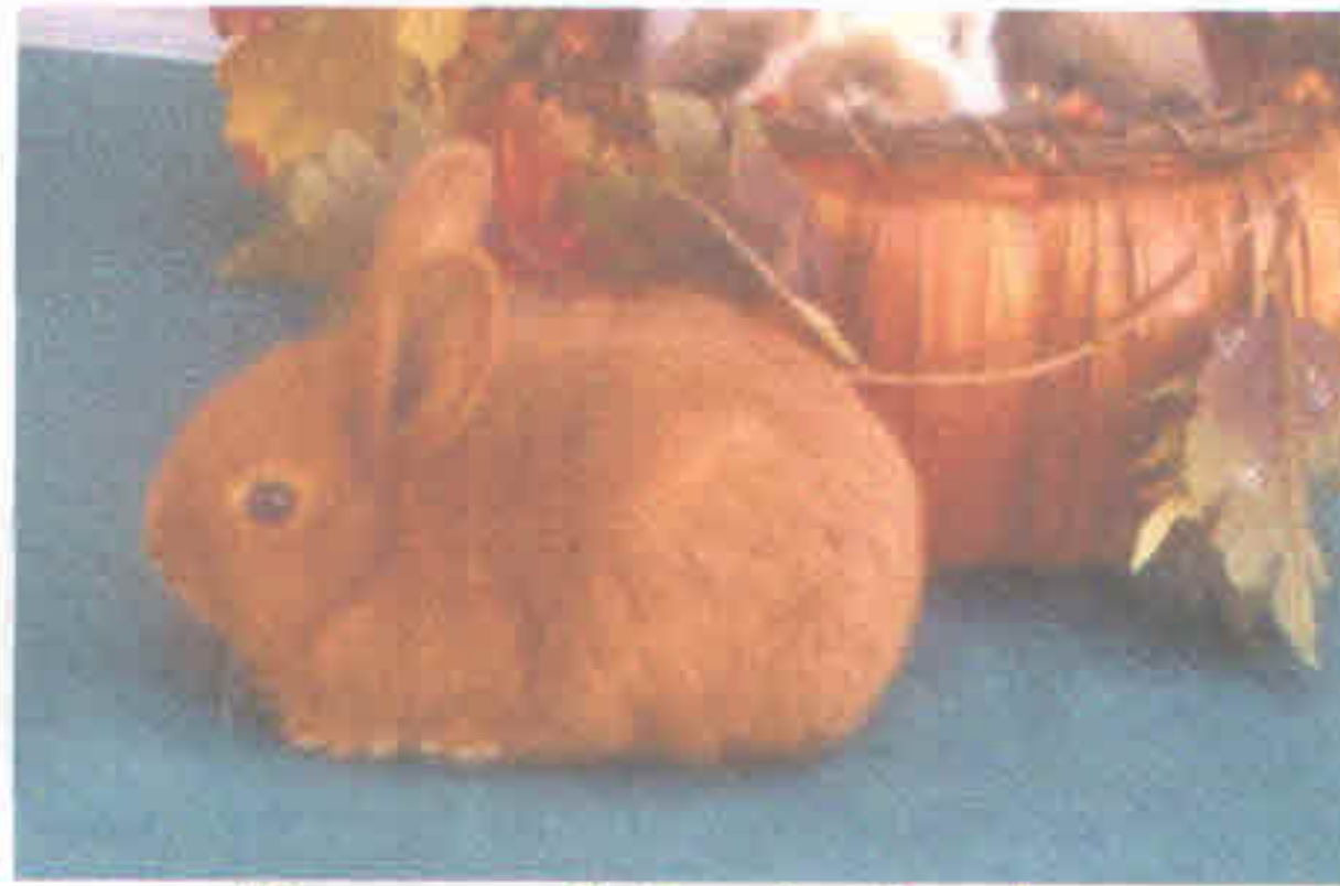
Dreamcatcher's Junior