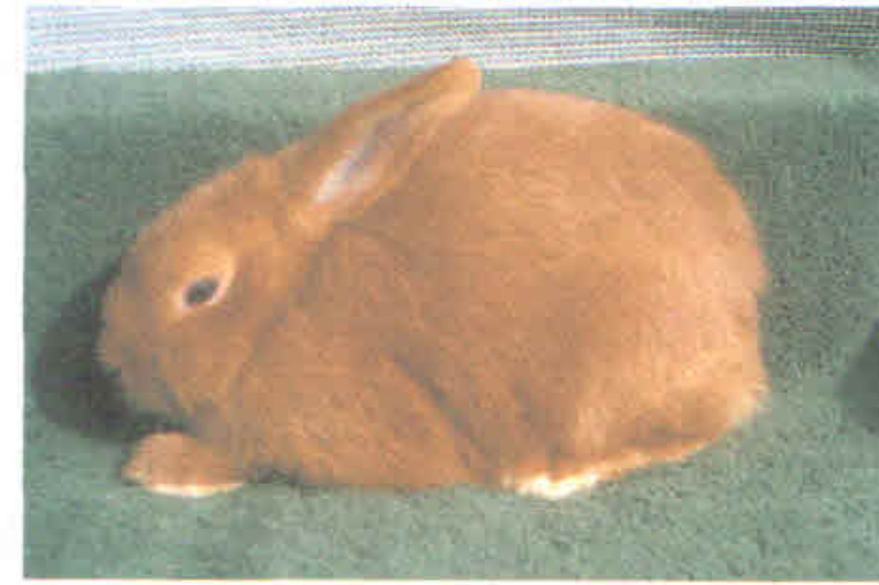
Dreamcatcher's DC1