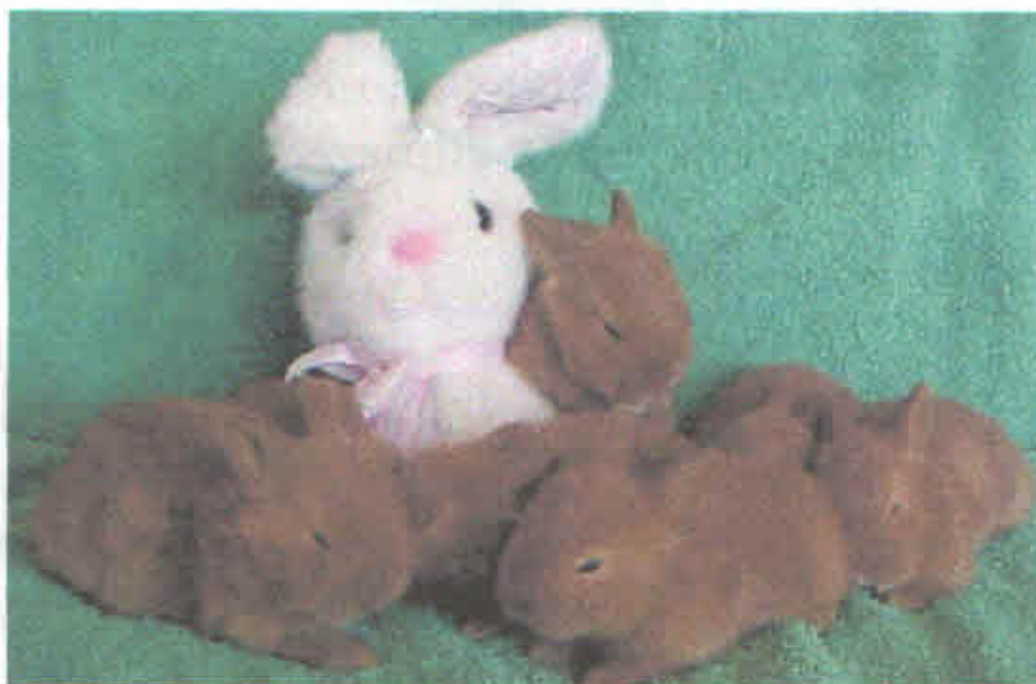
3 Week Old Litter