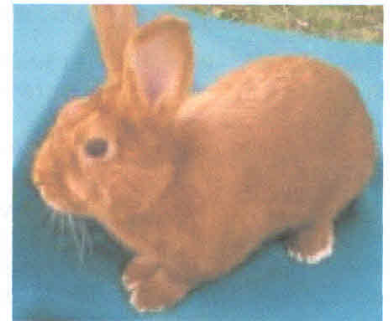
Dreamcatcher's DC1